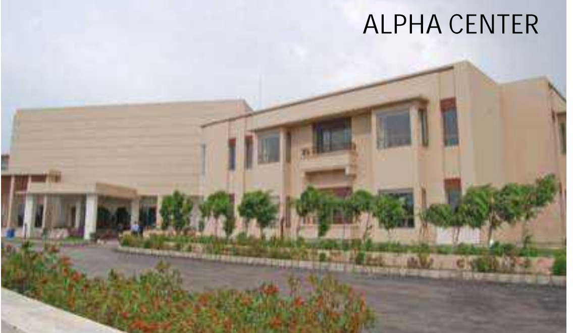
ACTUAL PHOTOGRAPHS OF ALPHA INTERNATIONAL CITY, KARNAL